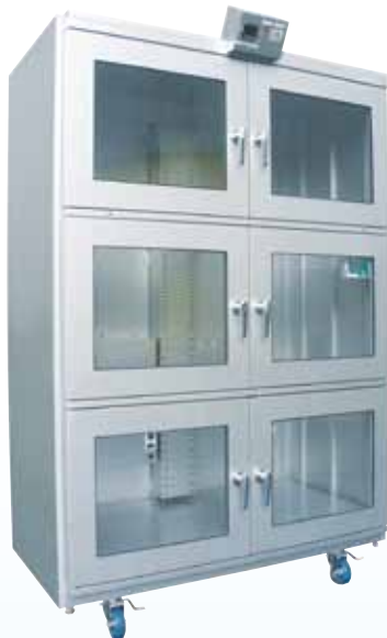
MB-1001 1200 (6-door)

This low-temperature, low-humidity baking oven can be used for low-humidity PCB storage and for dehumidifying IC packages with tape reels that cannot be hot-baked.