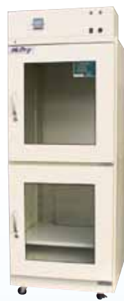
MB-301 300 (2-door)

Low-temperature, low-humidity baking can reset IC packages with tape reels that have exceeded their floor life. (JEDEC standard) Can also be used to dehumidify PCBs that cannot be hot-baked and to pre-bake PCBs during repairs. The baking heater can also be switched off, allowing the cabinet to be used as a room-temperature low-humidity cabinet.